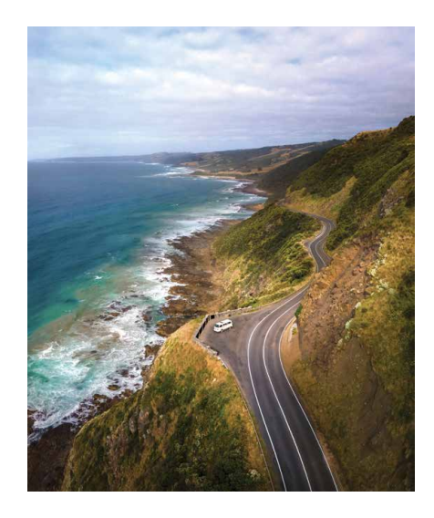
Great Ocean Road (VHR H2261)

The Heritage Council acknowledges that action against the threats of climate change must be incorporated into our statutory and operational activity now and into the future. We will do this by embedding climate action into our existing and future Strategic and Corporate Plans.