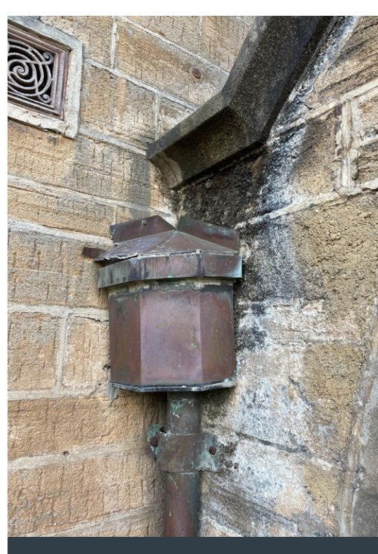
Salt deposition on limestone from gutter and downpipe overflow.

The site's exposed position leaves it vulnerable to damage caused by extreme weather. The existing gutters and site drainage systems could be overwhelmed in severe storms, causing flooding and associated damage to infrastructure.