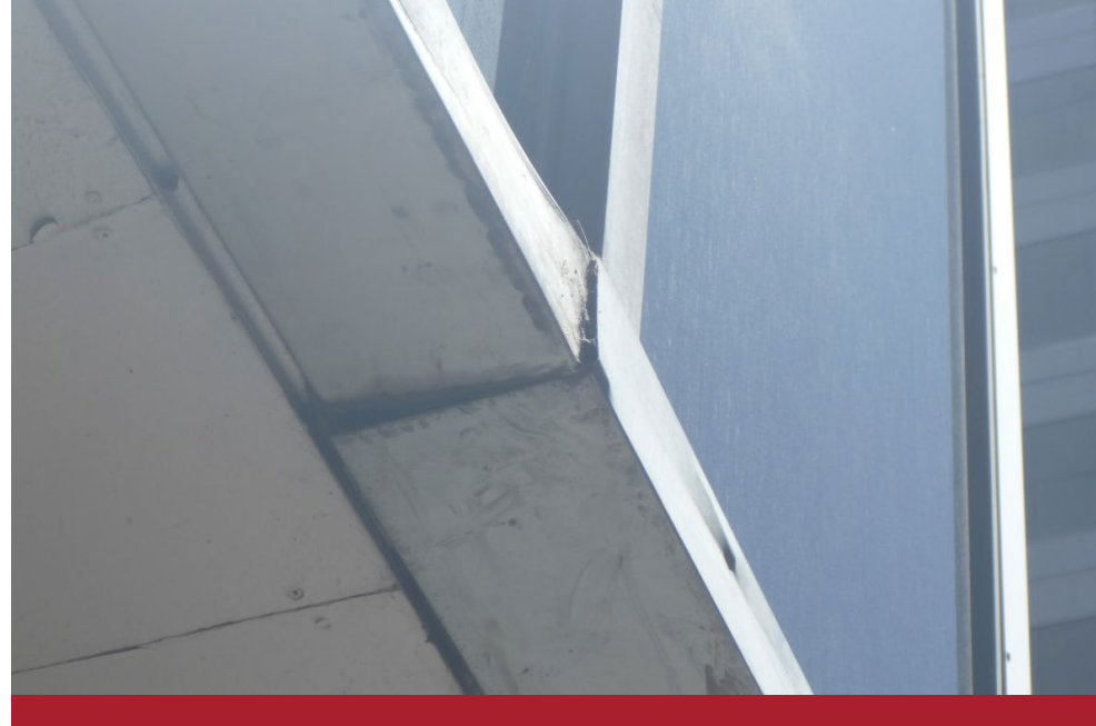
Climate change will accelerate deterioration of materials, e.g., more frequent and intense storms will lead to recurring damage to gutters.

When damage or deterioration has occurred, the heritage significance and the history of the building are considered when repairing or replacing material. The