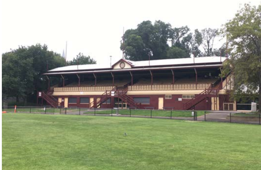
Fitzroy Cricket Ground Grandstand (February 2020)