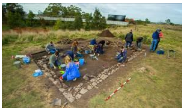
Left: Archaeologists and students at work at the Thomas Mill dig.

Artefacts uncovered include parts of pots, glass, bottles, china and slate pencils. Other parts of the excavation site revealed metal remains from the mill and Aboriginal tools. Artefacts were displayed at the City of Whittlesea offices in South Morang.