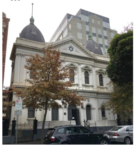
East Melbourne Synagogue (May 2018)