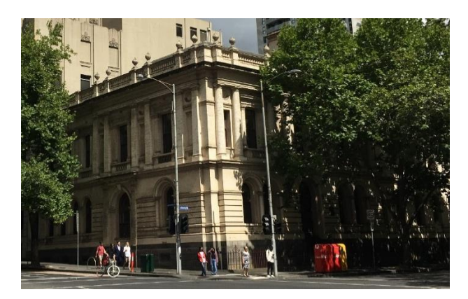
Titles Office (2017) showing building with tree coverage.

Titles Office (1985) showing building without tree coverage.